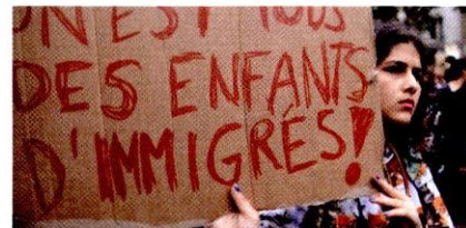
Understanding the battle against extremism, page 14