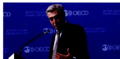
Help refugees integrate and contribute, page 30